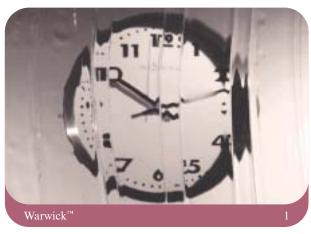
Due to the manufacturing process, the pattern of Warwick<sup> \infty </sup> is completely random and no two pieces are the same.